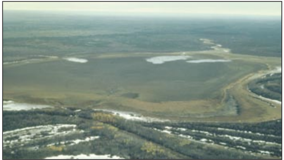
Located in the far northwest of Alberta, Hay-Zama is one of 1,069 wetlands around the world designated as an internationally significant area under the Ramsar Wetlands Convention.

begrudgingly give in. They chose the latter, and the HZC bus was back on the road.