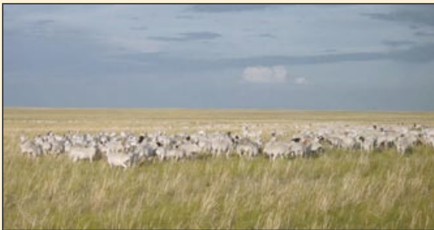
As in Hay-Zama, the human presence in the Dalai Lake area has the potential for appropriate stewardship or ecological destruction. Overgrazing is one of the possible threats to this internationally recognized Ramsar site in Inner Mongolia.