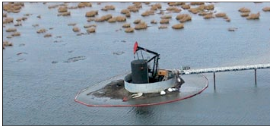
Several small oil spills have occurred in Hay-Zama in the last few years, but the companies involved have contained the spills with booms and mitigated the damage. With oil and gas activity phasing out of the area, the risk of a major spill will gradually diminish until 2017, when industry will no longer be active in the Wildland Park.

Occasionally, though, even well-intentioned neighbours can get a little devious. On January 31,